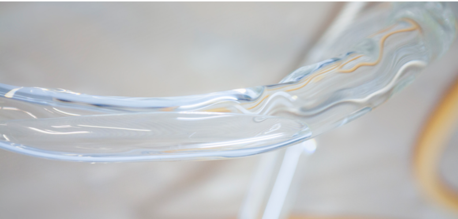
LARA FLUXÀ, LLIM (detall), 2022. Tècniques: vidre i aigua.

Water has fertile power because it becomes silt when in contact with the earth. From the black mud of the Nile, the fertile land, comes the Arabic word khemia, alchemy, which has historically found a source of inspiration in glass, and its practitioners used it for the transmutation of base metals. LLIM does not aspire, in any case, to the obtaining of gold nor of the quintessence: it moves the foundation of Venice with the same calm that it metabolizes and returns the materials to their origin.